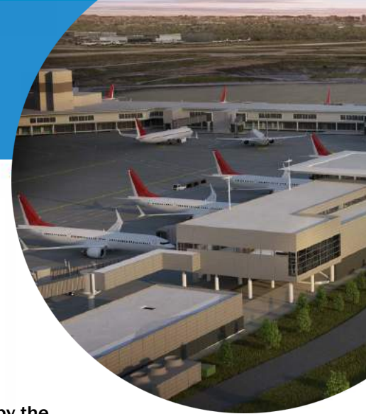
Concourse D Exterior (conceptual image)