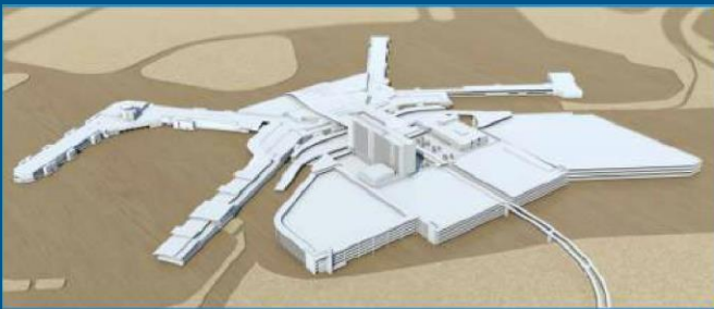
Nashville International Airport as it will look in 2023. Conceptual image