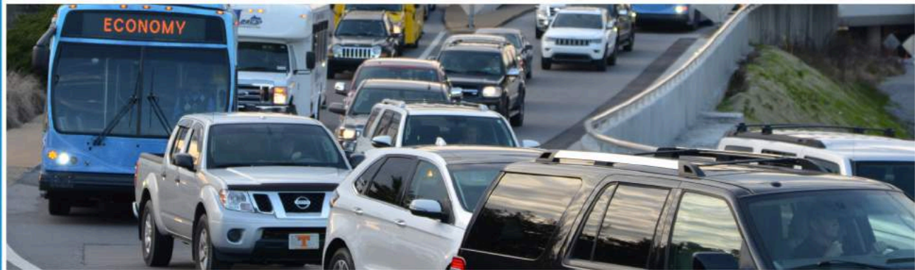
This project is necessary to prepare for rising regional traffic and airport utilization anticipated in 2023 and beyond.