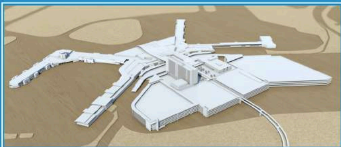
Nashville International Airport as it will look in 2023. Conceptual image

Traffic congestion at BNA is already noticeable at peak times. Without improvements, the results will be significant back-ups by 2023 and gridlock by 2028. With traffic and airport utilization continuing to rise, the Donelson Pike Relocation and Terminal Access Roadway Improvements projects are vital to improving access to and circulation around BNA.