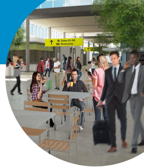
Concessions and aircraft gates in the new concourse. (conceptual image)