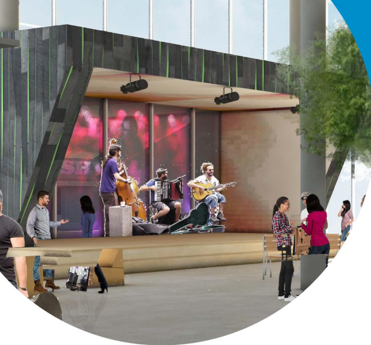
Concourse D will feature a live music stage. (conceptual image)