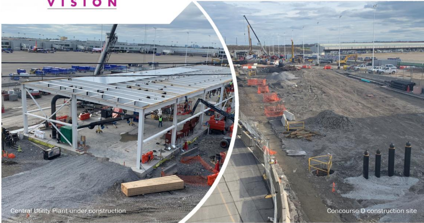
Central Utility Plant under construction