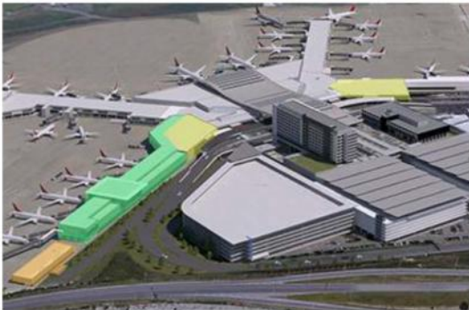
■ Concourse D ■ Terminal Wings ■ Central Utility Plant