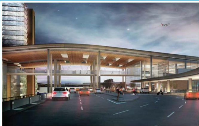
New BNA entrance, as it will appear in 2023, with roof canopy as seen from Departures level.

The terminal lobby and International Arrivals Facility (IAF) project is key to connecting Nashville to even more destinations around the world. It will provide travelers an expanded and visually engaging central terminal as well as a state-of-the-art IAF.