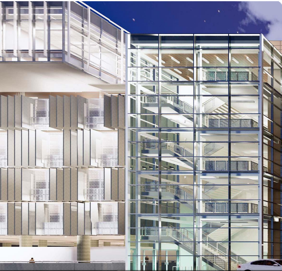
West elevation of the Terminal Garage, as seen from the Main Terminal. (conceptual image)