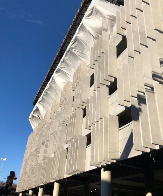
Pictured: West elevation of the Terminal Garage, as seen from the Main Terminal.