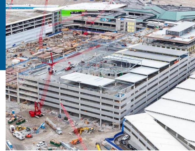
Aerial view of the Terminal Garage construction site, east elevation.