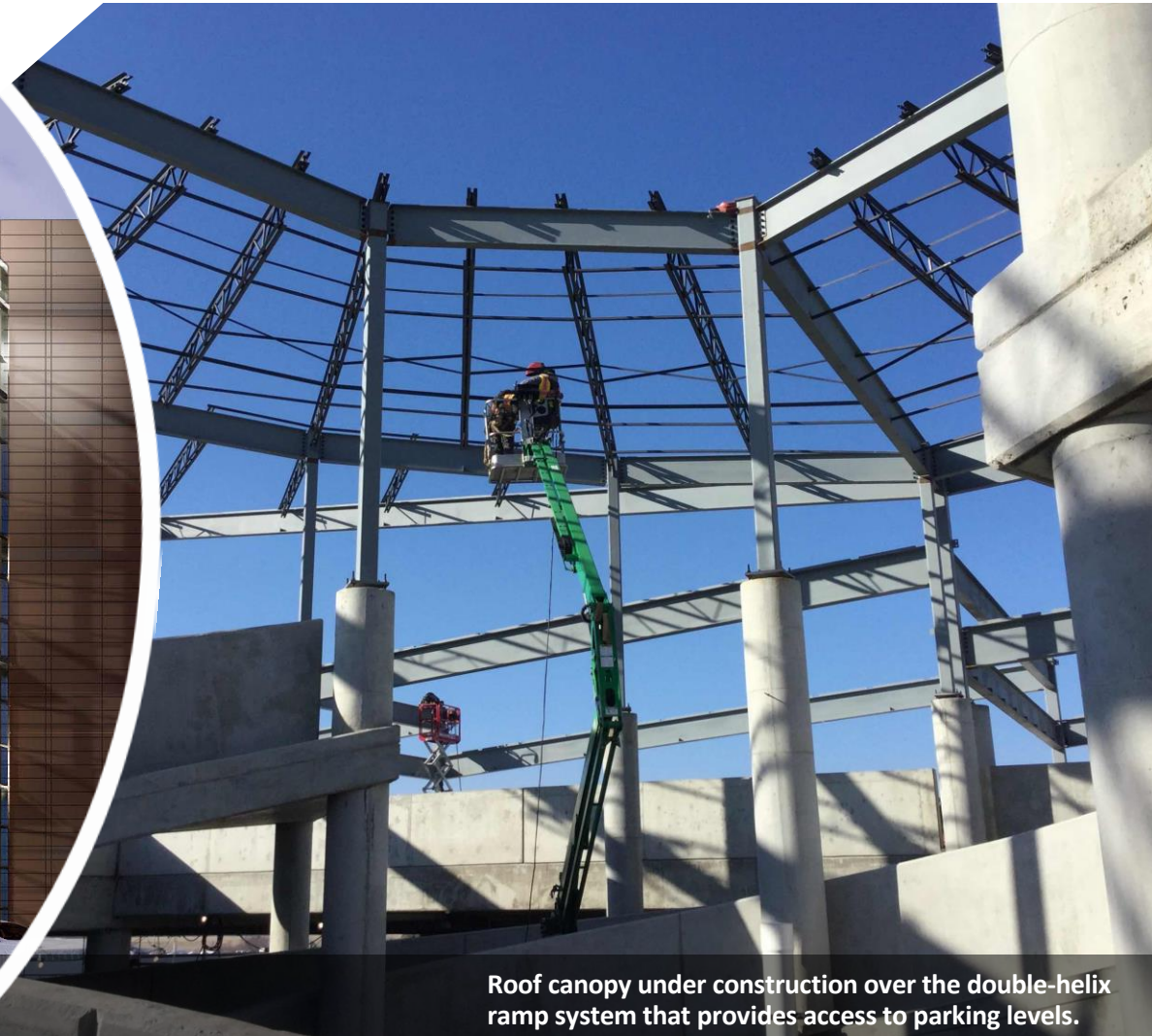
Roof canopy under construction over the double-helix ramp system that provides access to parking levels.