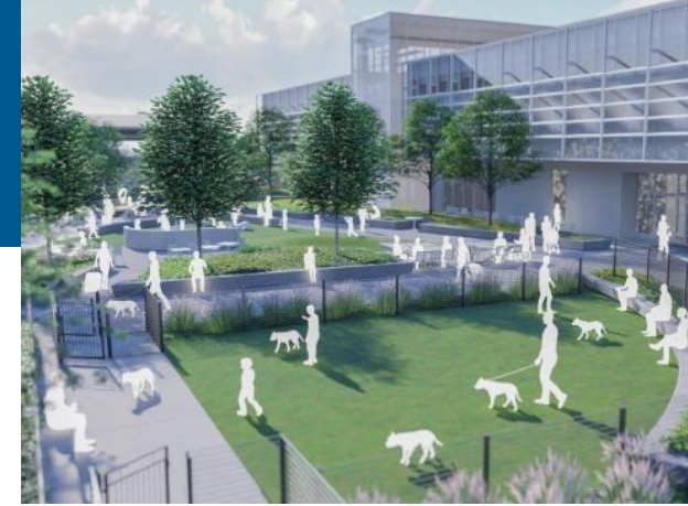
Pictured: The Pedestrian Plaza and Airport Administrative Building. (Conceptual image)