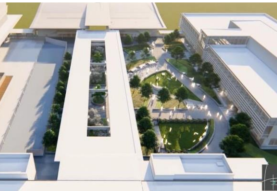
Pictured: The Pedestrian Plaza and Airport Administrative Building. (Conceptual image)