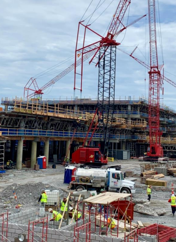
Pictured: Construction continues on the Terminal Garage.