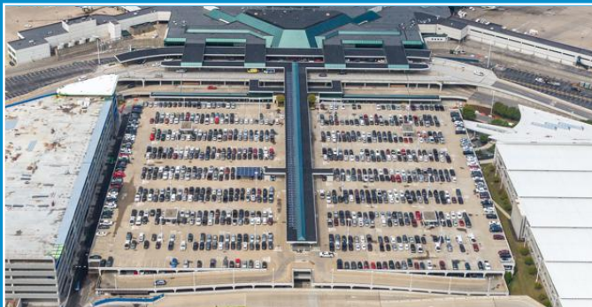
The existing Short Term Parking Garage will be demolished to make way for much more parking and other amenities.

The Terminal Parking Garage & Airport Administrative Office project will add thousands of short-term parking spaces for travelers' convenience, as well as a new airport administrative office . It will be built on the site of the existing Short Term Parking Garage, which is set to be demolished after BNA's new Parking and Transportation Center opens this fall.