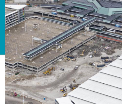
Pictured: Short Term Garage demolition