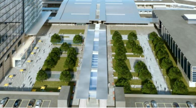
Pictured above: The new garage will feature a pedestrian plaza (center) and airport administrative building (far right). A hotel (shown at far left) is planned for a future expansion of the garage.