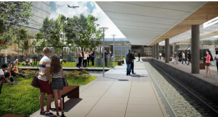
Pictured above: The pedestrian plaza and airport administrative building.