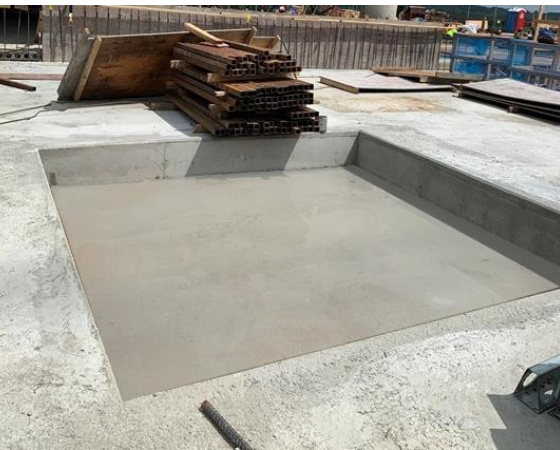
Planters for trees that will grow in the Pedestrian Plaza.