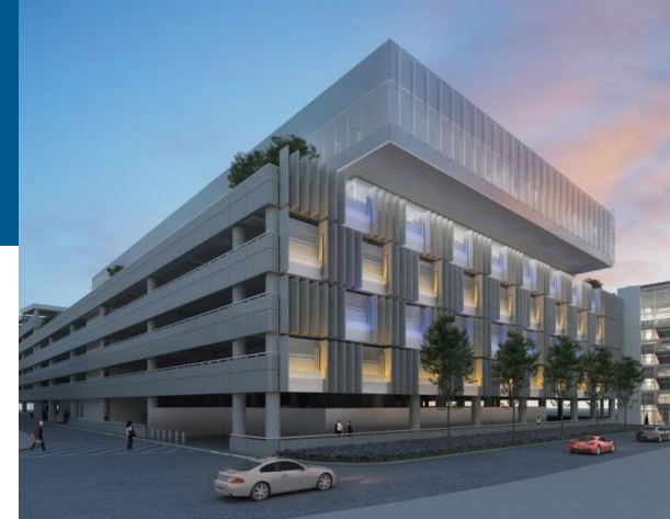
Pictured: Terminal Garage, west elevation, across from the Terminal. (Conceptual image)