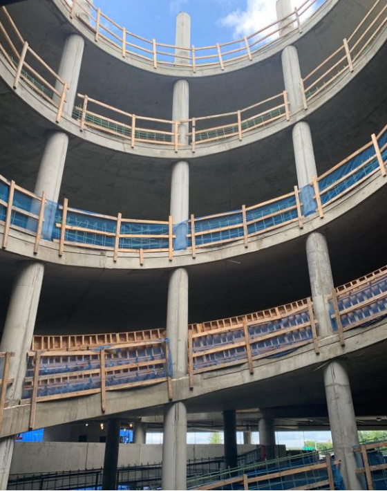
The Terminal Garage will feature a double helix ramp system for access to parking levels.