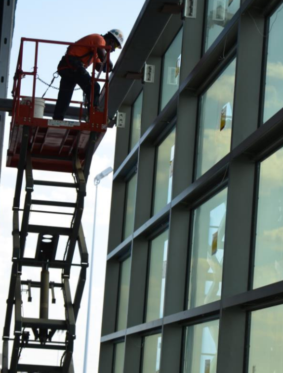
Glazing continues at Concourse D.