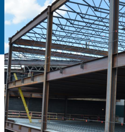
South Terminal Wing steel will be complete in late October.