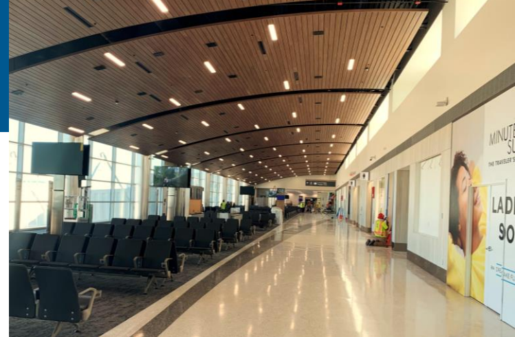
Concourse D interior (Gates D1-D3)