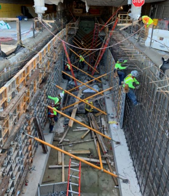
Wall formwork for a tunnel that will connect the International Arrivals Facility to Level 1 of the main terminal.