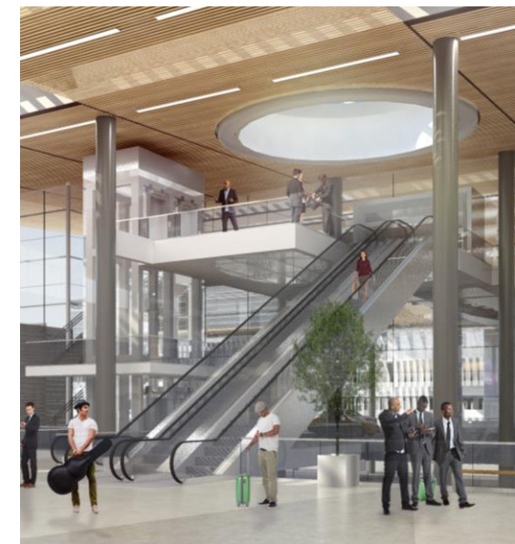
Pictured: The terminal lobby as it will appear in 2023.