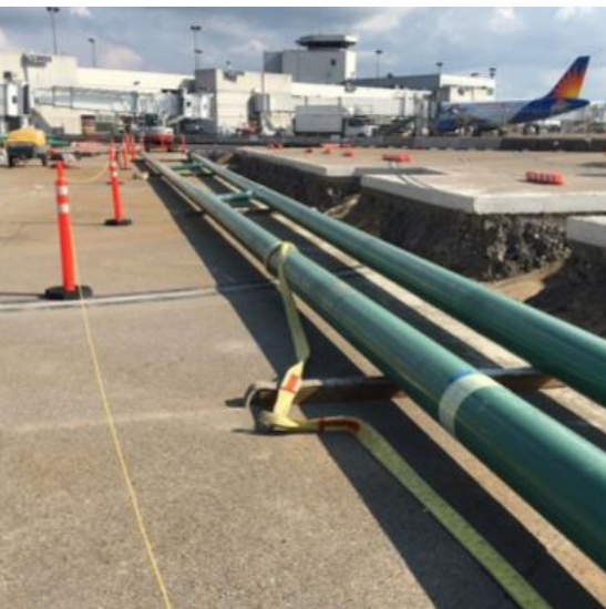
Fuel line installation is underway for the six future international gates.